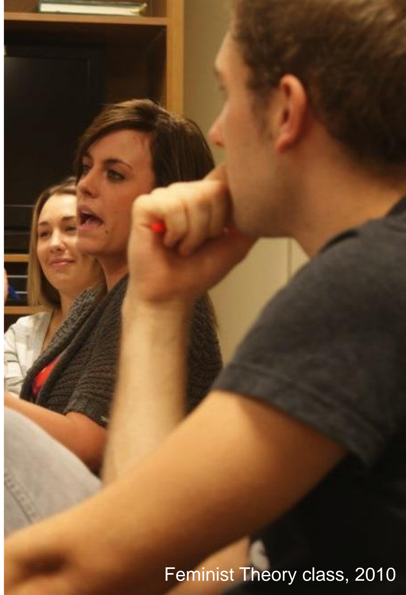
Feminist Theory class, 2010