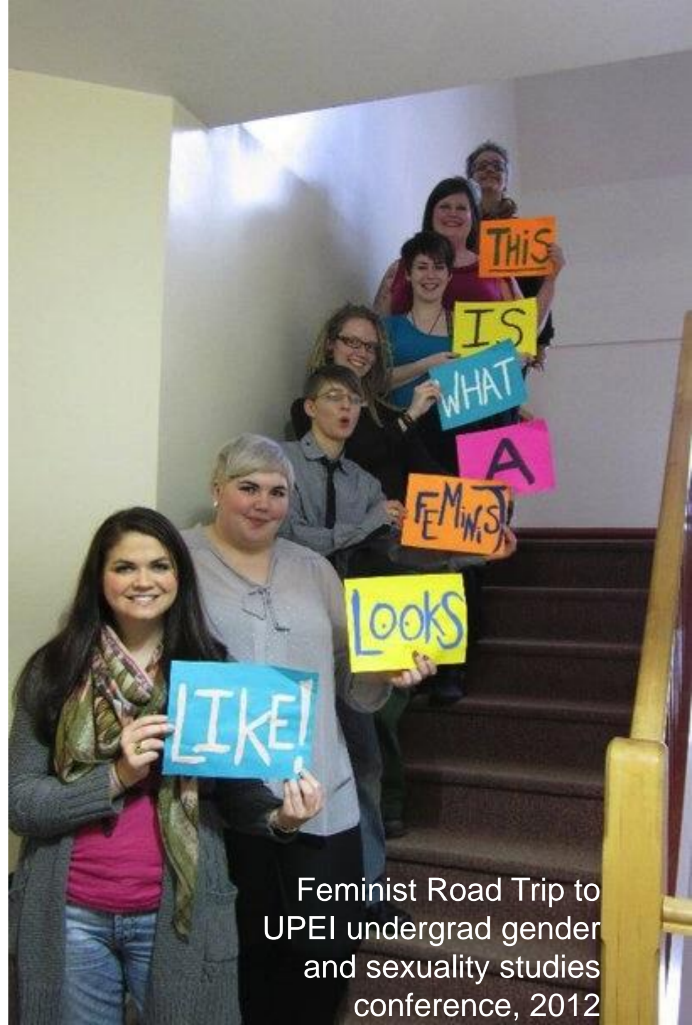
Feminist Road Trip to UPEI undergrad gender and sexuality studies conference, 2012