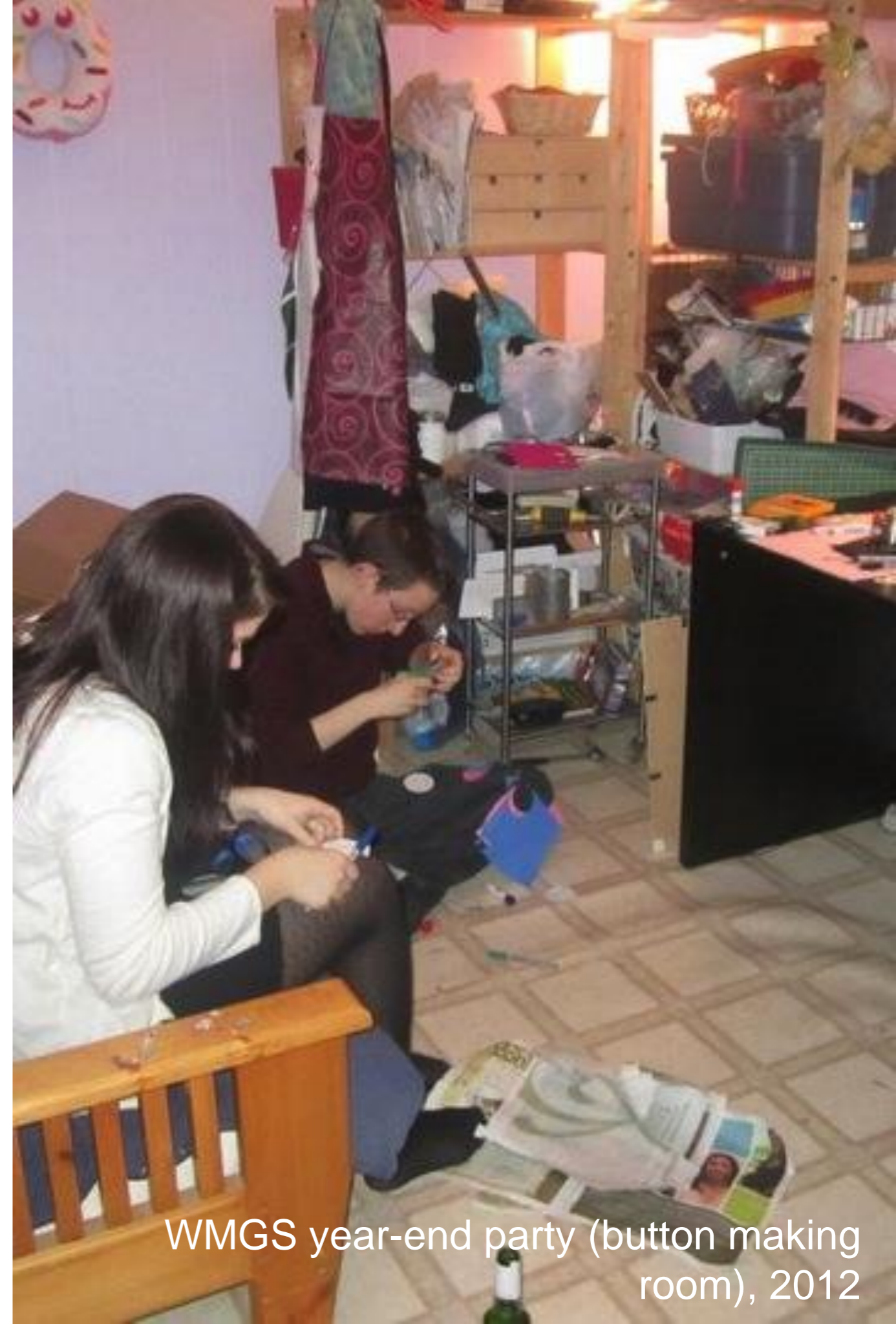
WMGS year-end party (button making room), 2012