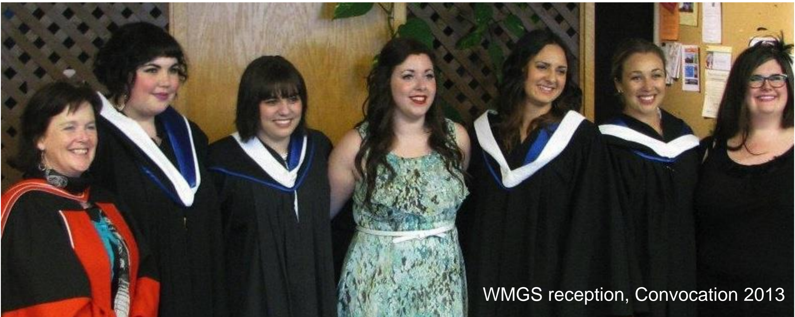
WMGS reception, Convocation 2013